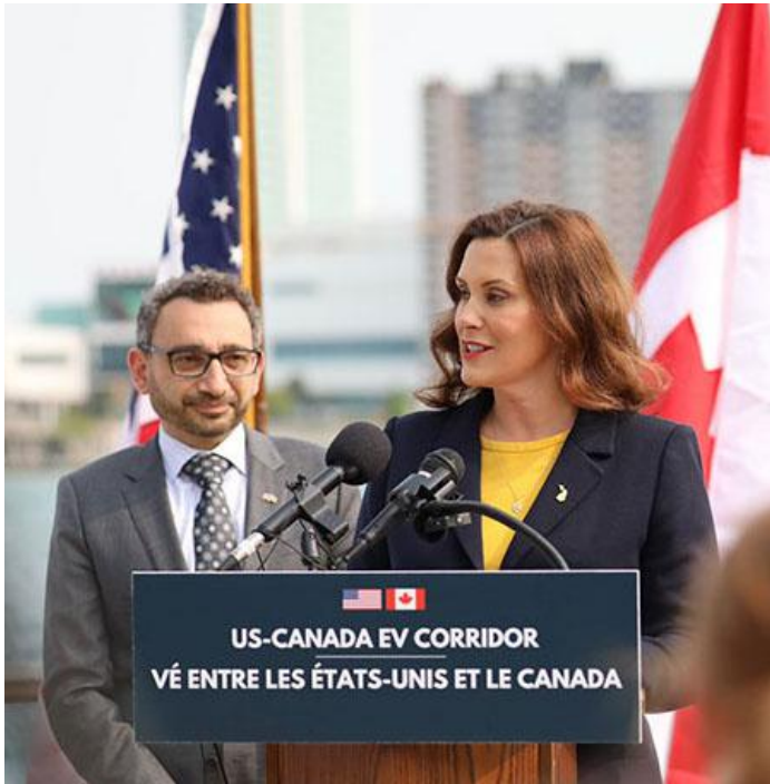
Canadian Minister of Transport Omar Alghabra and Michigan Governor Gretchen Whitmer at the US-Canada EV Corridor announcement