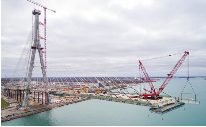
Gordie Howe International Bridge construction