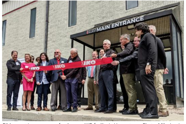
Ribbon cutting ceremony for the new IKO facility in Hagerstown.