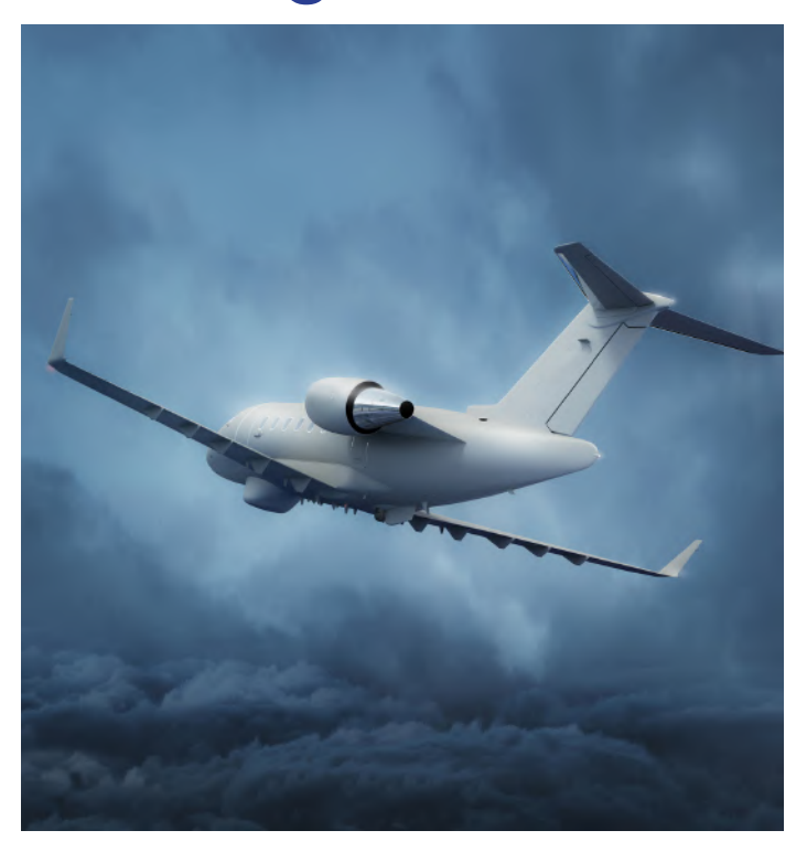
Bombardier Defense Challenger 650.