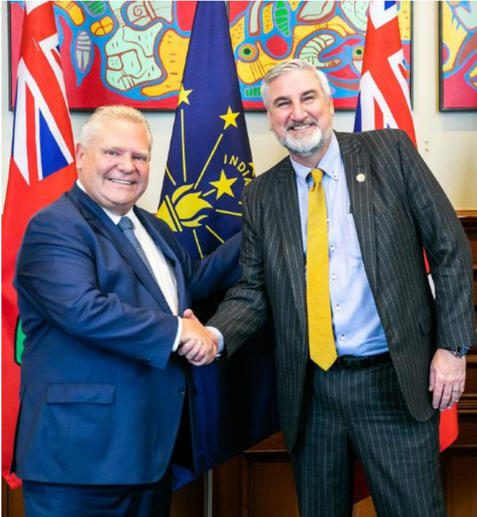
Ontario Premier Doug Ford and Indiana Governor Eric Holcomb